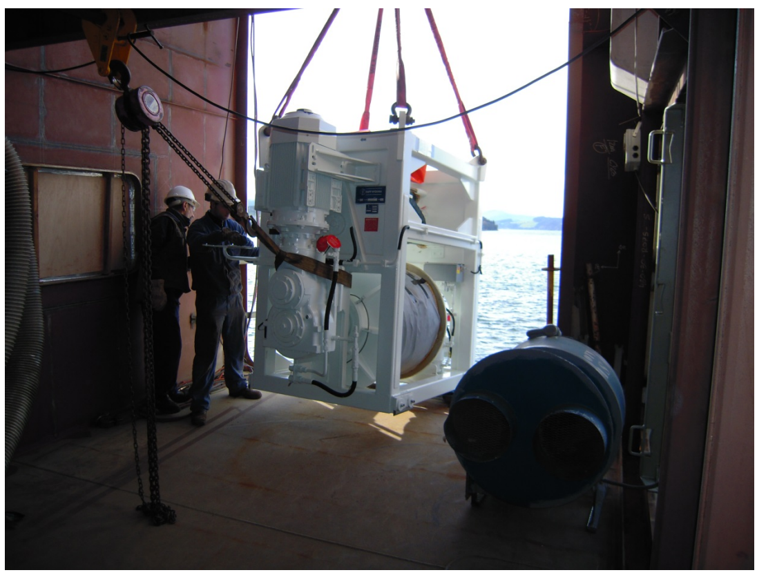
Gangway "cassette" ready for mounting on board