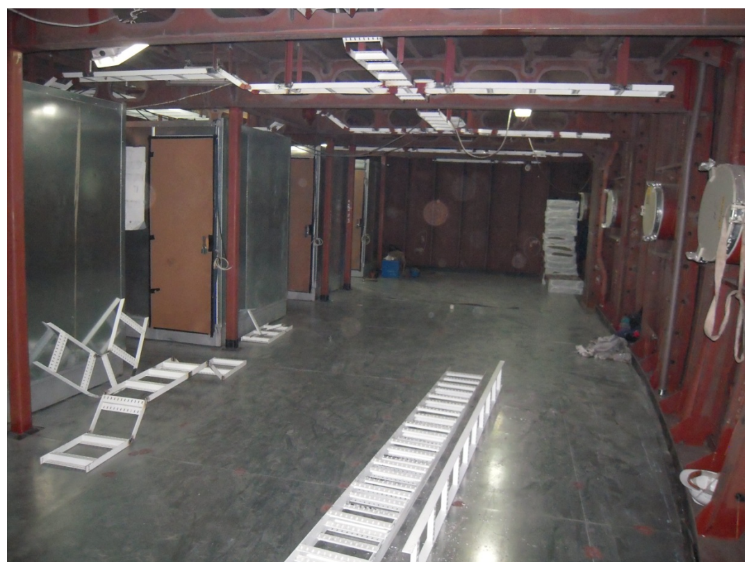
Main Deck – sanitary discharge piping

Tween dk: Floating floor and cable tray installation – Bathroom units almost in position