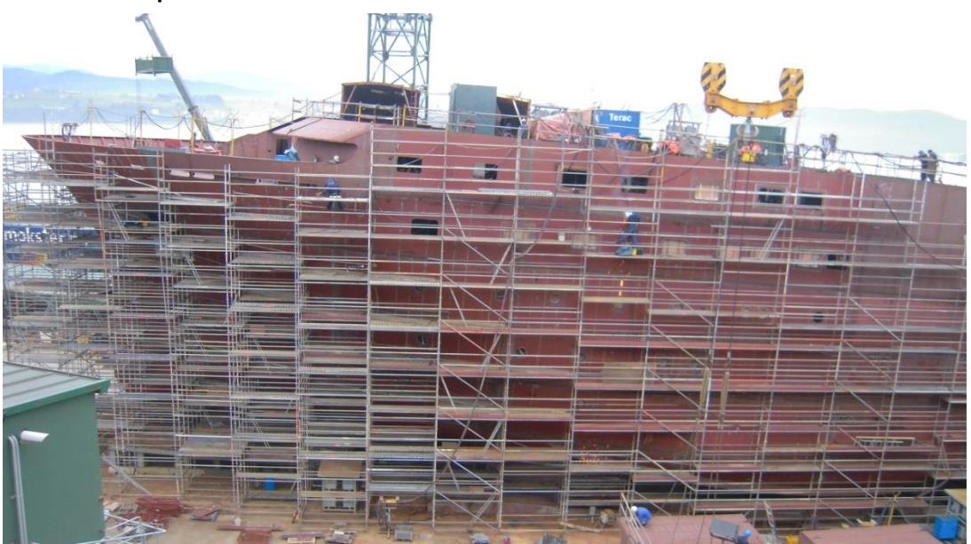
Bow area completed.

44 blocks placed and assembled on slipway by 31.10.15