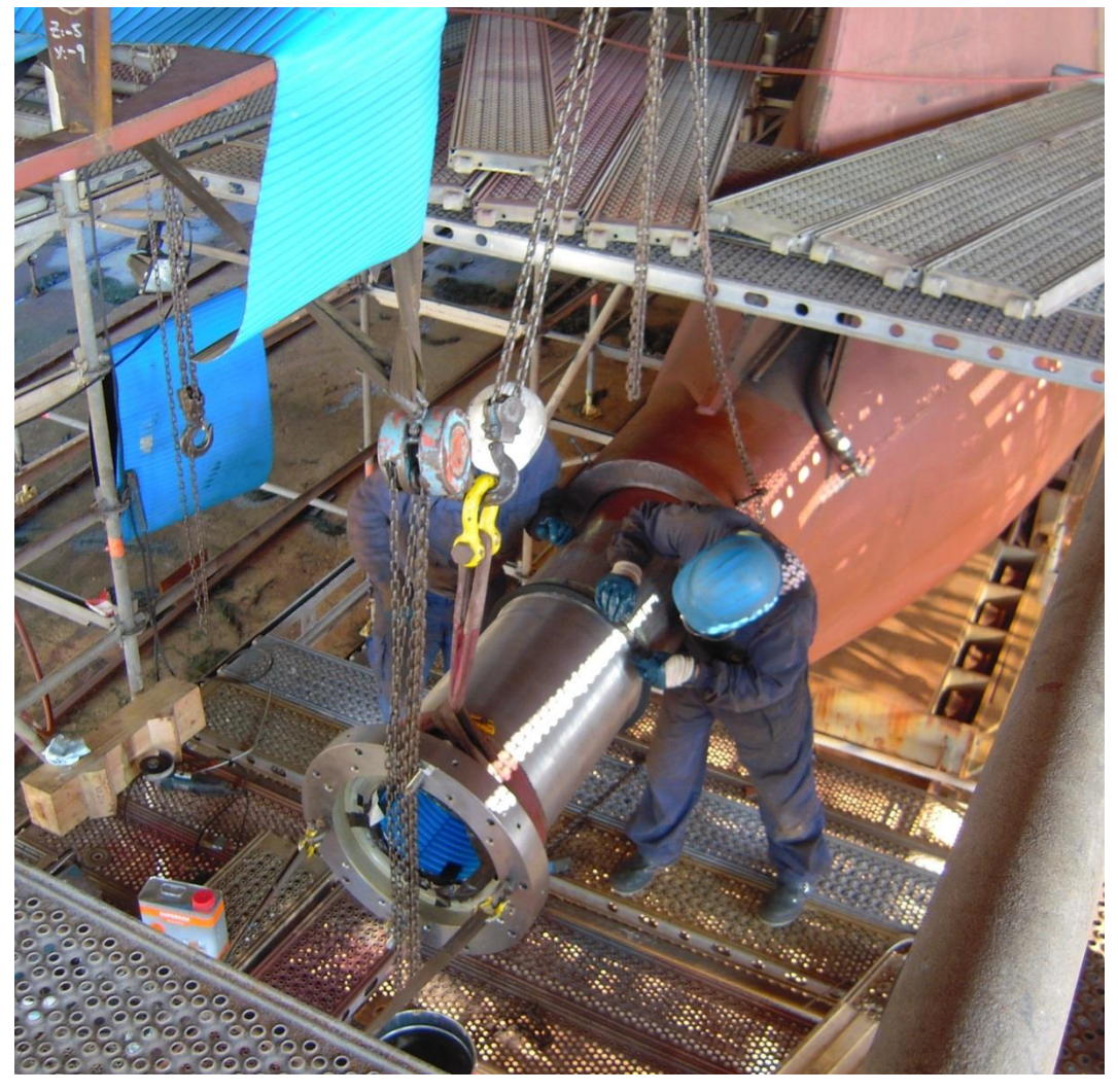
Rudder stock tube installed